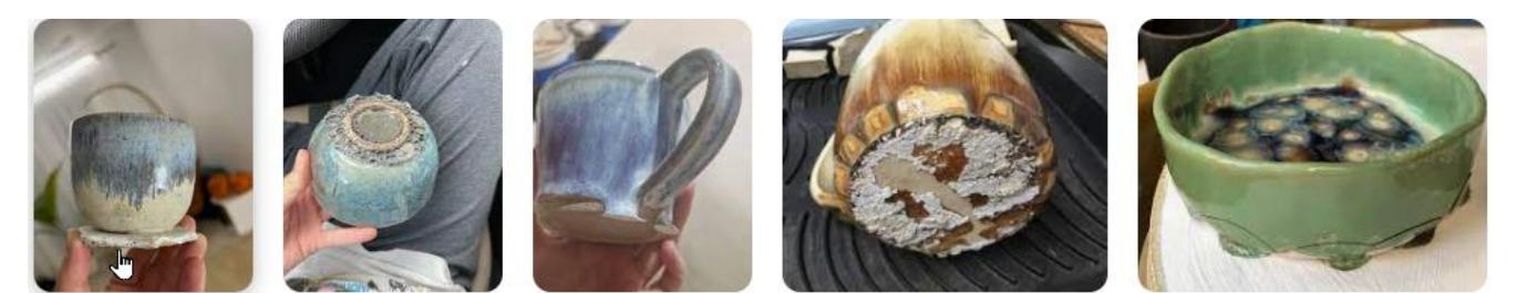
Sizing Your Kiln Cookies